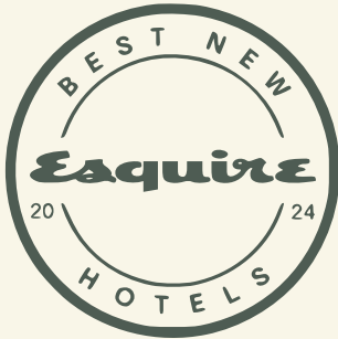
ESQUIRE Best New Hotels 2024