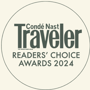
2024 READERS' CHOICE AWARDS Ranked #18 in Northern California