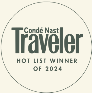
2024 HOT LIST Best New Hotels in the U.S. Best New Hotels in the World