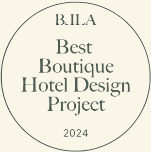
BLLA AWARDS 2024 Best Boutique Design Project