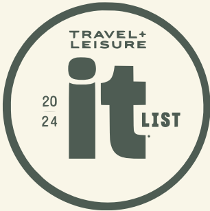
TRAVEL + LEISURE IT List 2024