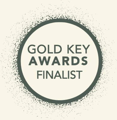
HOSPITALITY DESIGN GOLD KEY AWARDS 2024 Finalist: Guestroom Midscale Finalist: Resort