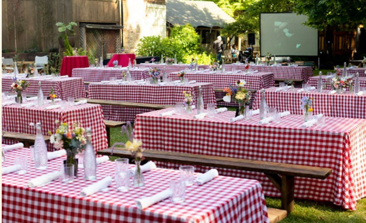
Sycamore Green & The Bandshell