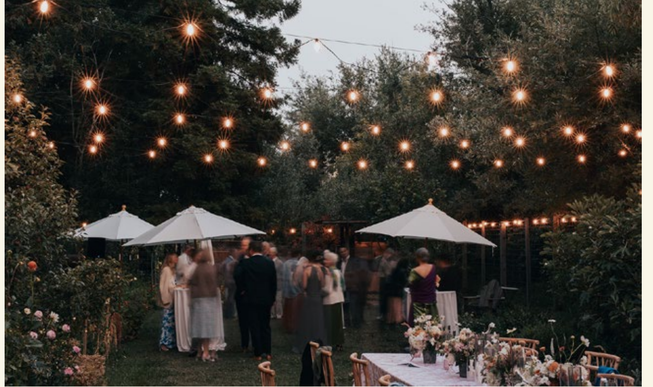
The Kitchen Garden