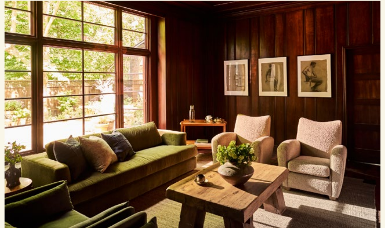
The Spa at Dawn Ranch