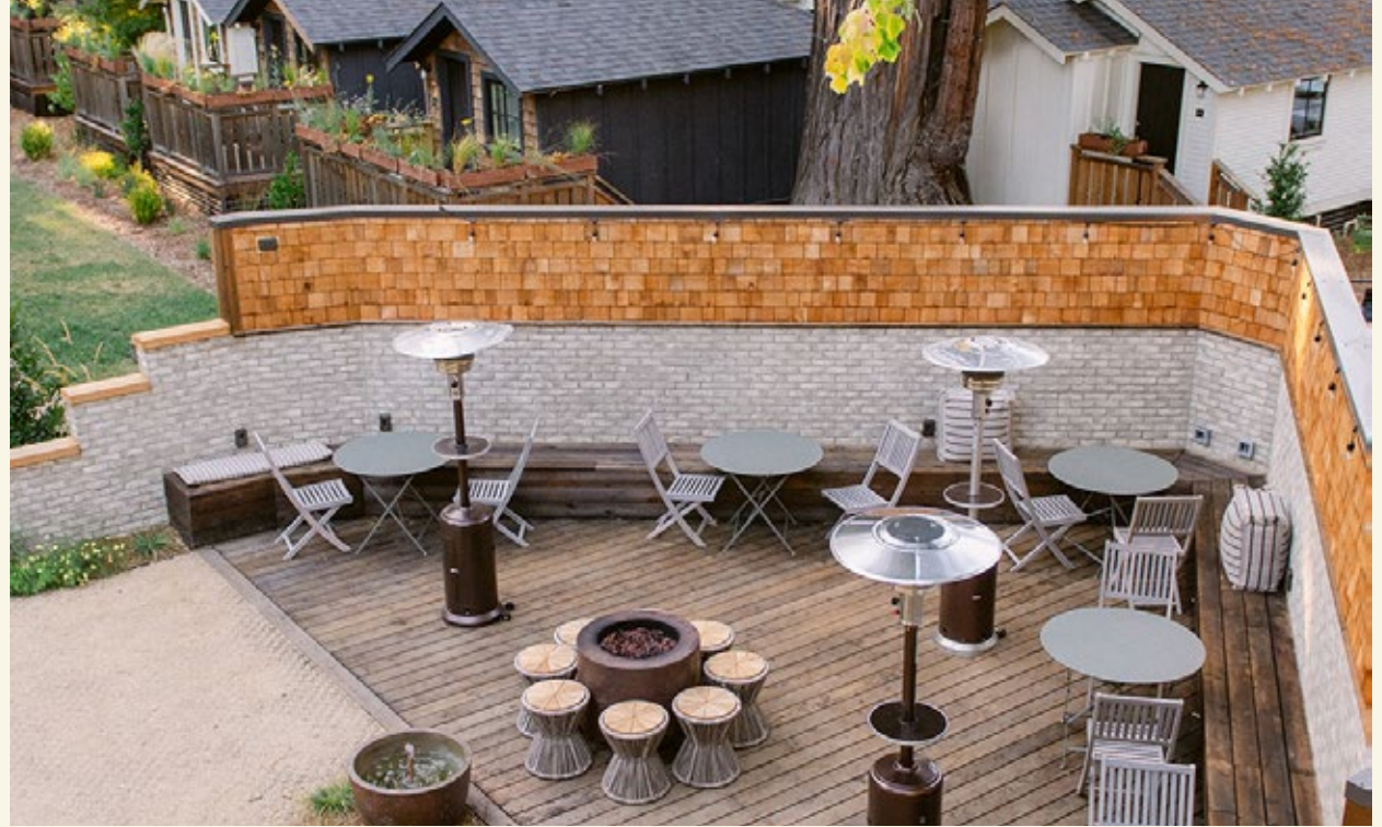
Sycamore Green & The Bandshell