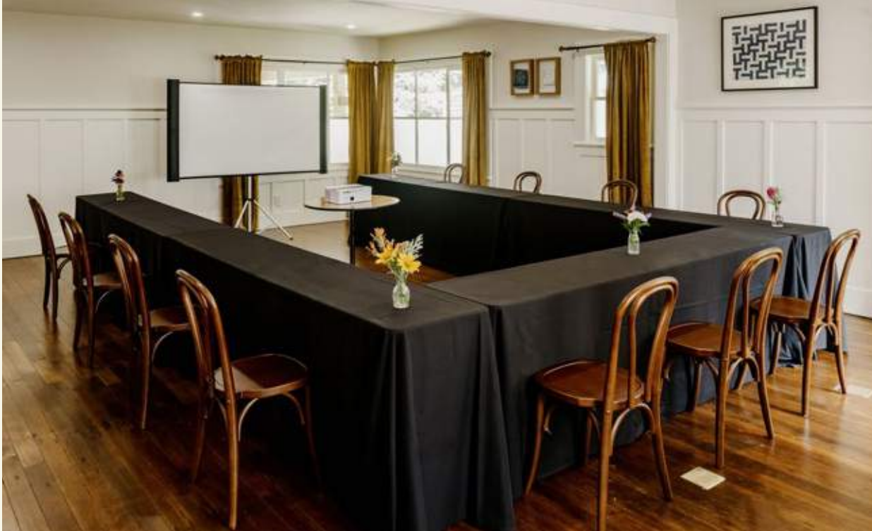
Fifes Conference Room