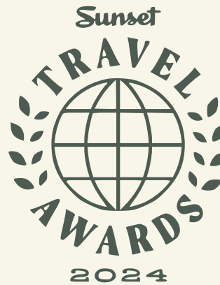
SUNSET TRAVEL AWARDS 2024 Top Wine Country Hotels