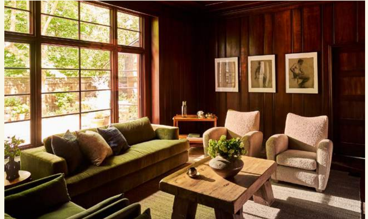
The Spa at Dawn Ranch