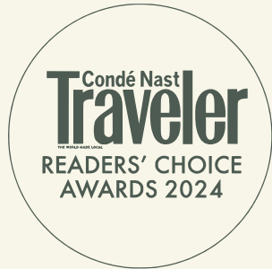
2024 READERS' CHOICE AWARDS Ranked #18 in Northern California