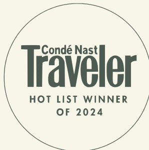
2024 HOT LIST Best New Hotels in the U.S. Best New Hotels in the World