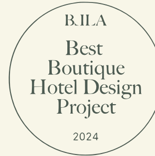
BLLA AWARDS 2024 Best Boutique Design Project