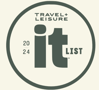
TRAVEL + LEISURE IT List 2024