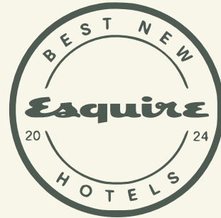
ESQUIRE Best New Hotels 2024